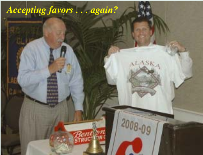
Accepting favors . . . again?