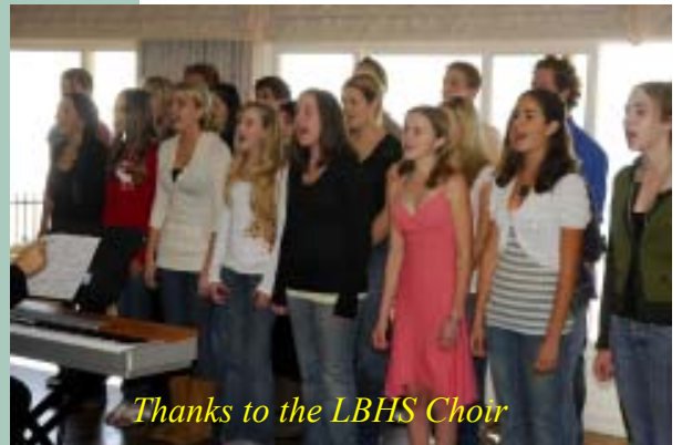
Thanks to the LBHS Choir