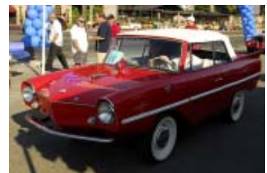
Amphicar - A People's Choice