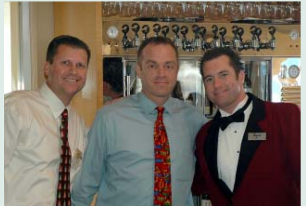
Thanks to the Hotel Laguna staff!