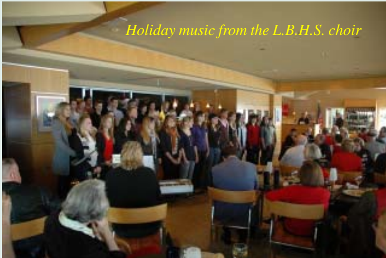
Holiday music from the L.B.H.S. choir