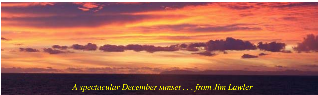
A spectacular December sunset . . . from Jim Lawler

Please feel free to submit your Rotary related photos during your travels - we'll share them in the Breeze.