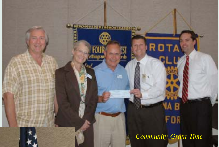
Community Grant Time